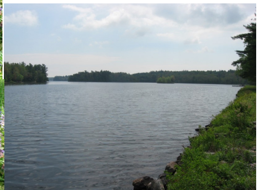
LAKE NAOMI - SUMMER