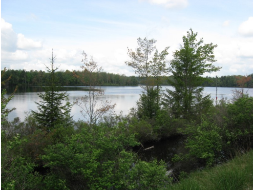
POCONO LAKE - SUMMER

The Tobyhanna Creek/Tunkhannock Creek Watershed is a beautiful piece of land that dramatically changes with the seasons. Here is one year in photographs.