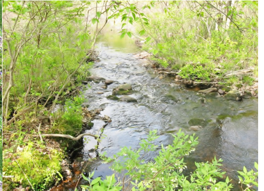
KISTLER RUN - SPRING