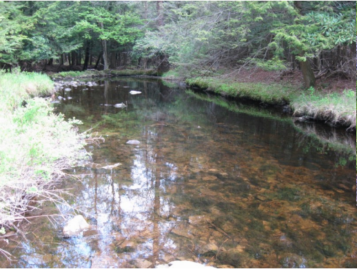
HUMLER RUN - SUMMER