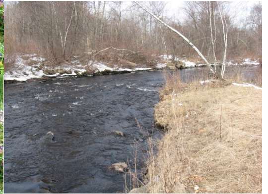
TOBYHANNA CREEK - SPRING