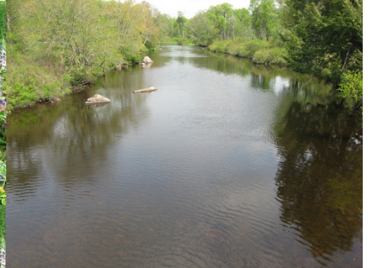
TOBYHANNA CREEK SUMMER