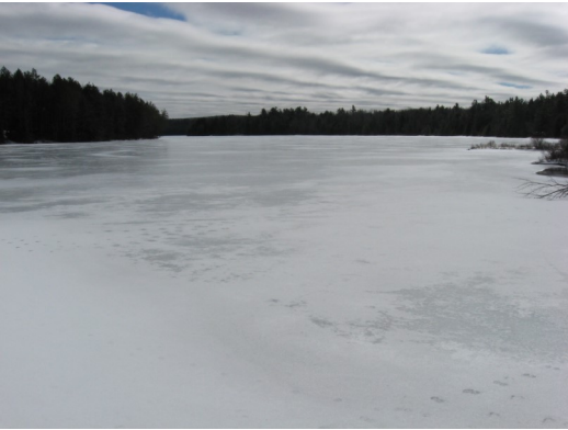
POCONO LAKE - WINTER