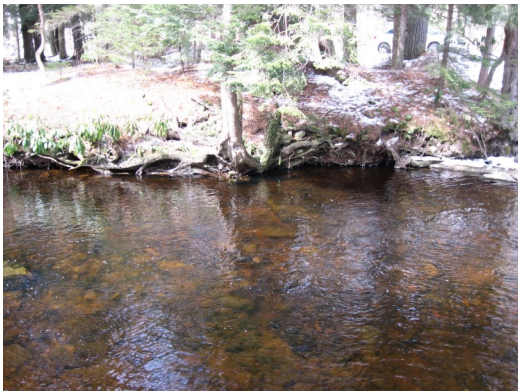
TUNKHANNOCK CREEK - SPRING